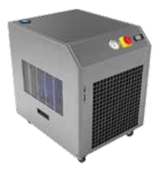
Industrial Water Chillers