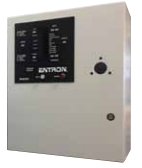
AC & MFDC Welder Controls