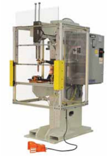
Platen style SlimLine Spot Welder with safety guard and light curtains