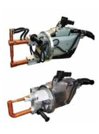
Scissor and C-gun Style Portable Spot Welders