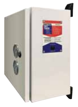
Unitrol Soft Touch Safety Enhancement