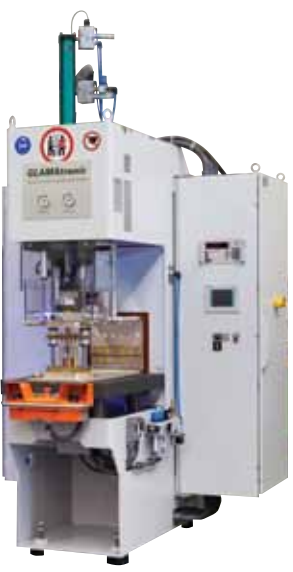
C-frame Capacitor Discharge Resistance Welder