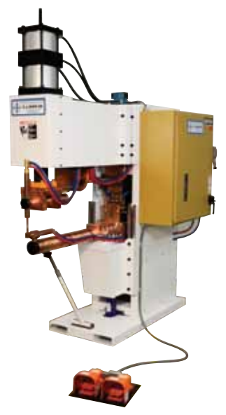
Heavy Duty Press Type Resistance Spot Welder