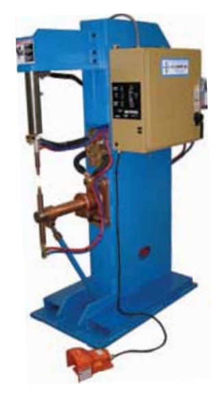
Horn style SlimLine Spot Welder