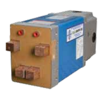
AC & MFDC Welding Transformers