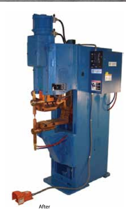
Ready to reassemble