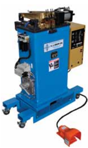
Heavy Duty Resistance Butt Welder