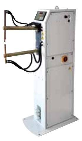
Light Duty Rocker Arm Spot Welder