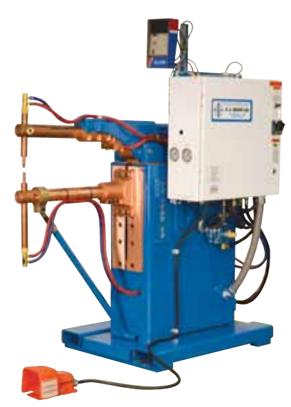
Heavy Duty Rocker Arm Spot Welder